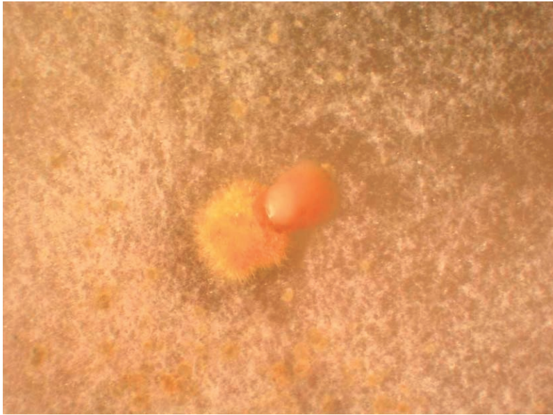
Figure 1. A dissection microscope view of a typical sporodochium (diameter, ~1 mm) formed by a morphologically atypical Phialemonium curvatum isolate discussed in the present study.

stiff, spiny hairs and an interior filled with yellow, mucoid conidia. They often opened apically, but lateral openings were also common (figure 1). Microscopic examination showed that the inner sporodochial surfaces were composed of stiff, frequently rebranching hyphae that were brownish in their lower, thicker regions, with tapered discrete and intercalary phialides (figure 2). Conidia formed in sporodochia had an ellipsoidal